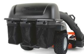
HUSQVARNA COLLECTION SYSTEM 598 39 02-01