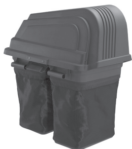
ZTR® ZERO TURN DOUBLE BIN COLLECTION SYSTEM 587 41 24-01